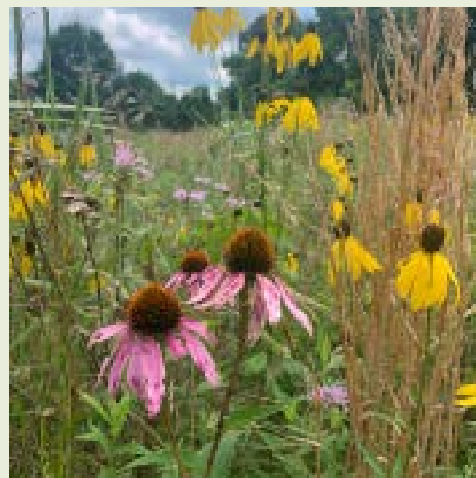
Mulhals' native pollinator habitat near Floyds Fork.

However, the small garden plots put in throughout Louisville with a focus on native cultivars are essential to this progress as well, regardless of their size!