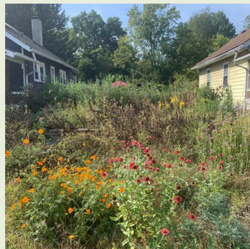
Chango Gardens (above) hosts a high tunnel growing strawberries, squash, garlic, and Brussel sprouts, just off Garland Ave.

The NRCS has high tunnel assistance through technical guidance and the EQIP program. The JCSWCD also provided a high tunnel grant and a high tunnel maintenance cost share program. These programs are all combined for Jefferson County residents, who qualify, to extend their growing season and conserve soil and water through better management. The use of high tunnels is allowing for more food production in the food deserts of Louisville as well as a smaller carbon footprint on those food items produced. Several new high tunnels were completed in 2023 in Jefferson County and five new high tunnels are being constructed this Spring through the JCSWCD program alone.